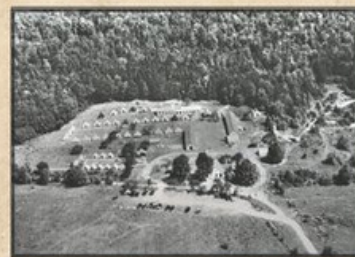
AERIAL VIEW OF CAMP ROBINSON IN EAST HARTLAND

RETIRED TEACHER AND AUTHOR OF 11 BOOKS, MARTY PODSKOCH WILL GIVE A POWER POINT PRESENTATION